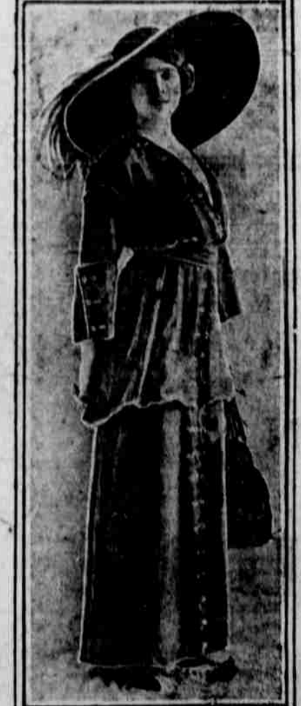
From Illustration, 1912, by Reuther. "Eminent Gown, 1912, See Text-Book Company." A transparent chiffon overdress and slip matches the navy blue liberty satin frock.