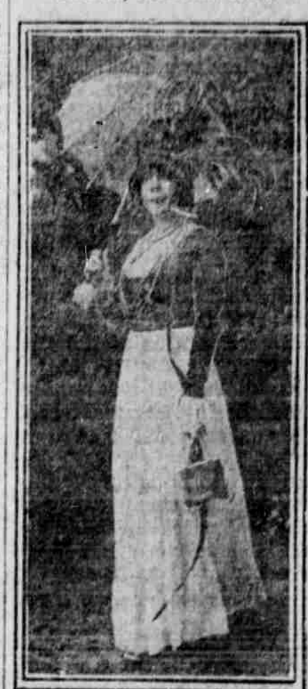
A quaint black with coat and hat worn at one of the French races.