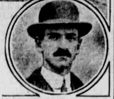
GLENN H. CURTISS

Followers of aviation in practice and theory are greatly interested in the return to America of Mr. Glenn Curtiss and his expressions of confidence that use of gyroscopes will solve stabilization problems.