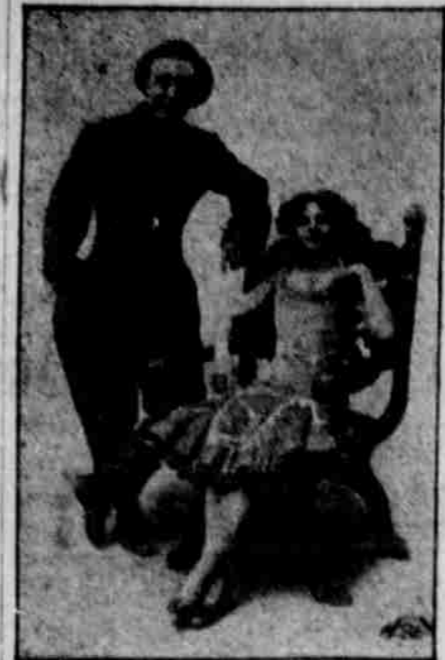
NEAL & NEAL Nifty Nonsensical Novelty.

can only marvel at. The display is very attractive.