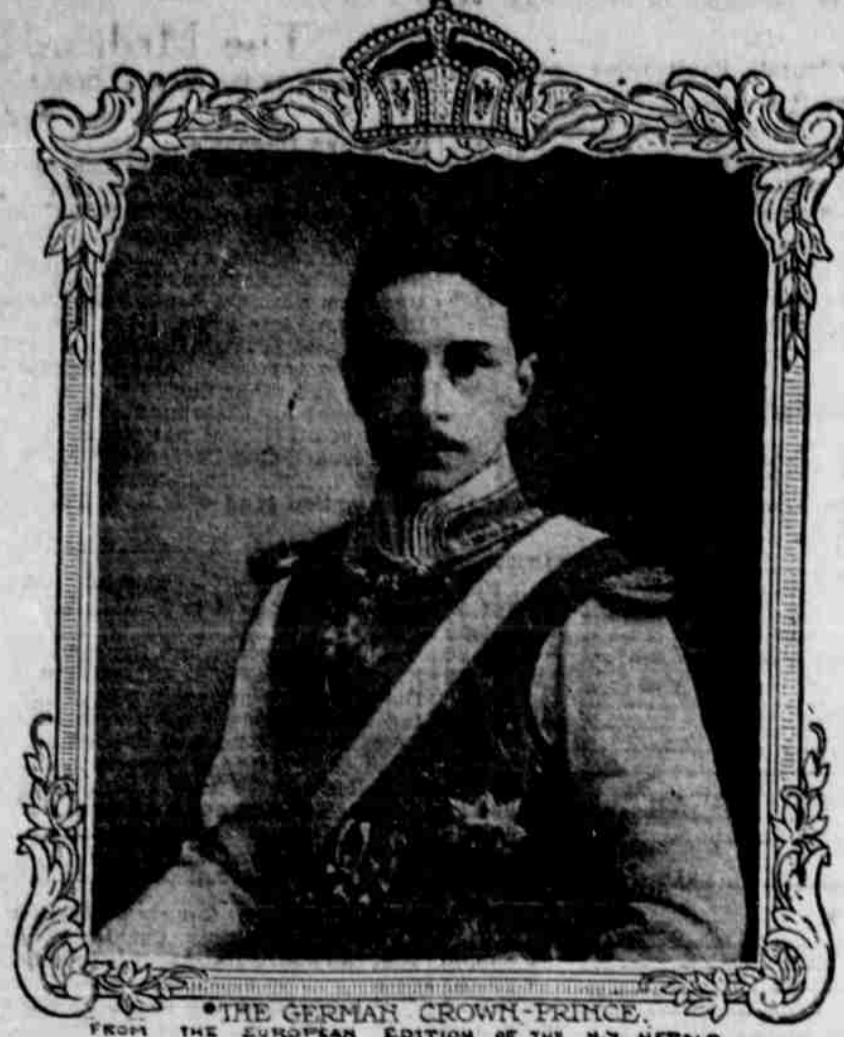
THE GERMAN CROWN-PRINCE.

Crown Prince Frederick William is said to be much worried over the illness of his illustrious father, Emperor William II. of Germany. There have been conflicting reports regarding the Kaiser's illness, but it is not considered serious.