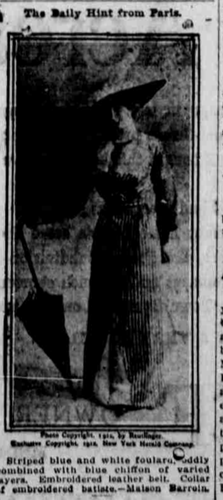
Stripped blue and white foulard, oddly combined with blue chiffon of varied layers. Embroidered leather belt. Collar of embroidered batiste.—Maison Martin.

C. D. HOON 15 Per Cent on Investment ARE YOU LOOKING? For a real bargain, I can show you one in 25 acres of Bear Creek bottom. All in bearing fruit, alfalfa and garden. Six room house, good barn and water. Within 1 1/2 miles Medford on Macadam road, Pacific Highway, R. F. D., telephone, gas and electricity. Low price and liberal terms. Or ten acres in bearing apples and pears in 1-4 mile of Central Point, 4 room house, etc. 15 per cent of price asked allowed for present crop if not desired by purchaser. See or write owner, Box 77, Route 2, Medford at once, as will sell.