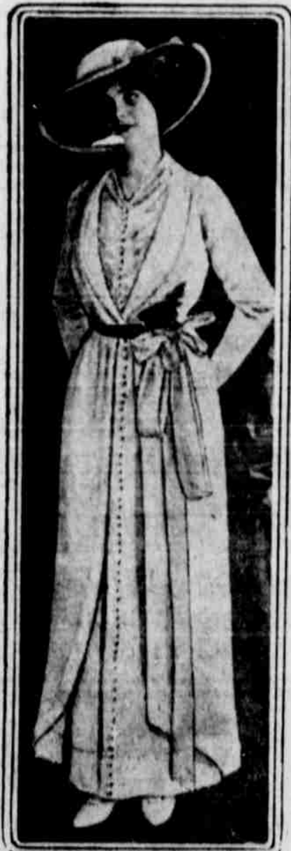
THE MADONNA DRESS AND HAT

Enters the "Madonna" costume. Fashion, ever privileged to induce in all sorts of vagaries, chose to present something entirely new in the dressmaking world.