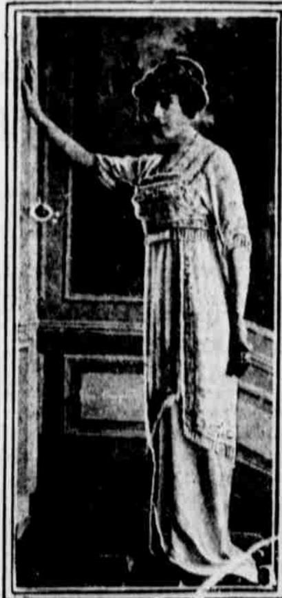
On Empire lines and with pointed train this evening gown is made of straw colored satin with matching net over tulle and brodered and fringed with beads.—Misson Bivalk.