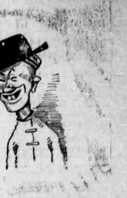
AH GEE WHIZ, THE CHINESE DELEGATE, WHO MUTT FEARS MAY CAUSE A SPLIT IN THE PARTY AND RUN HIMSELF ON THE LAUNDRY TICKET.