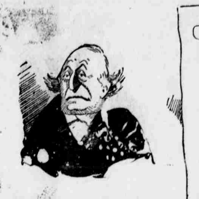
HONORABLE WILLIAM SALWAYS' TRYAN ISSUED THE FOLLOWING STATEMENT TODAY: "I'M GLAD TO LEARN THAT I WAS DEFEATED FOR TEMPORARY CHAIRMAN OF THE BALTIMORE CONVENTION, I WAS QUITE WORRIED FOR FEAR I SHOULD WIN. I'VE BEEN LOSING REGULARLY SINCE 1896 AND DIDN'T WANT TO WIN AND SPOIL MY RECORD"