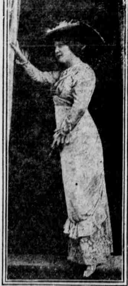
The "bit" trimming on a frock of white cashmere and lace, the latter placed over a turquoise colored silk lining.