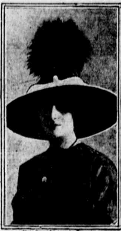
Black hemp straw piped and trimmed with white silk. Colored aigrettes.—Maison Carre.