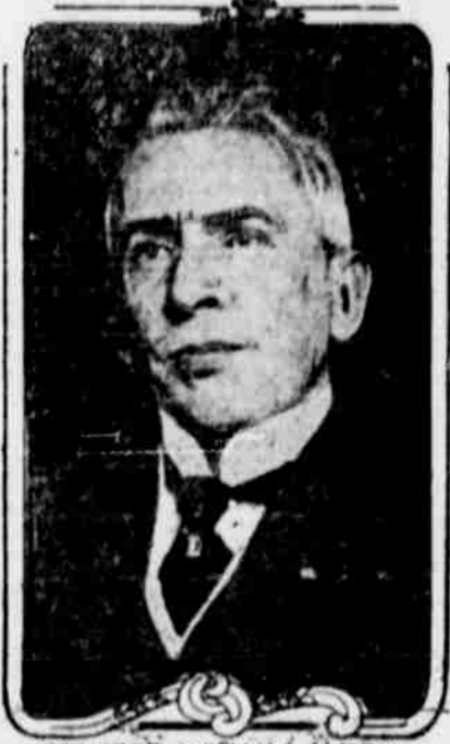
SENATOR WILLIAM ALDEN SMITH.

News Withheld and Sold for Blood—Money—Increased Life Saving Apparatus Demanded.