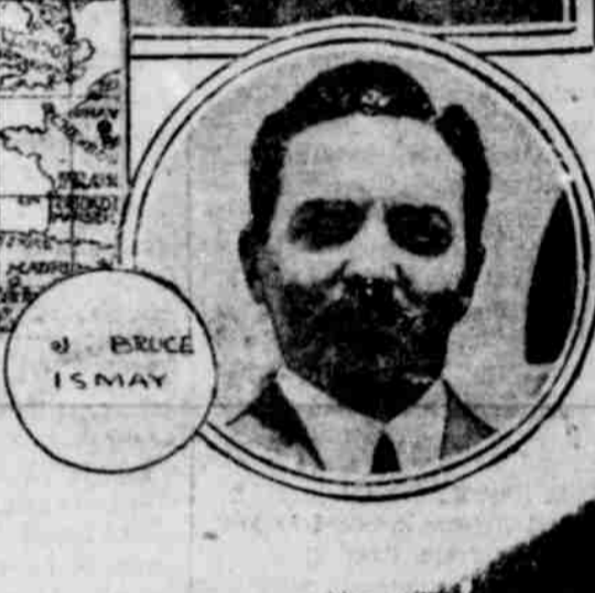
J. BRUCE ISMAY