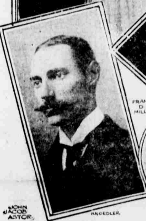
JOHN JACOB ASTOR