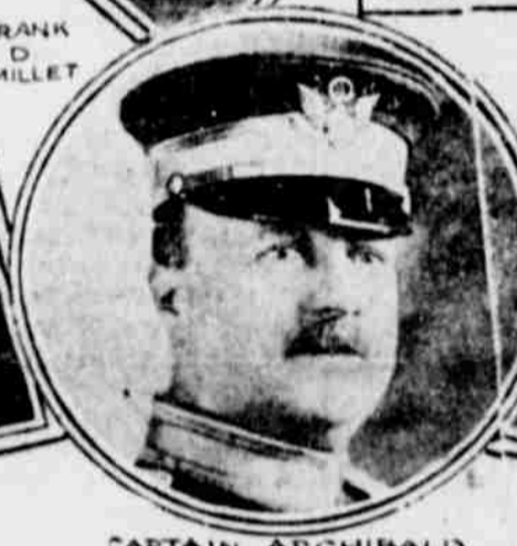
CAPTAIN ARCHIBALD BUTT