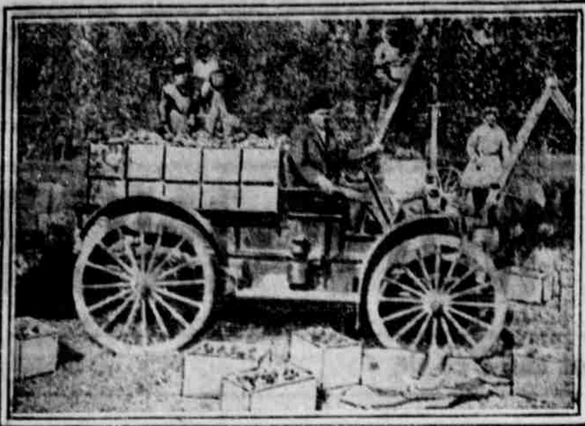
MOTOR WAGON USED IN APPLE ORCHARD.

Where quick deliveries are to be made, where there is a large amount of hauling to do, the motor driven vehicle is indispensable, says Better Fruit. Wonderful progress has been made in the improvement and development of the motor driven vehicles. They have passed through the experimental stage and have been placed on a practical basis. That a motor driven vehicle is a profitable investment for the modern business man is no longer a matter of conjecture—it is a conceded fact.