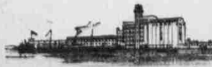
"AMERICA'S FINEST FLOURING MILLS"

Insist on having FISHER'S BLEND For sale by all Dealers