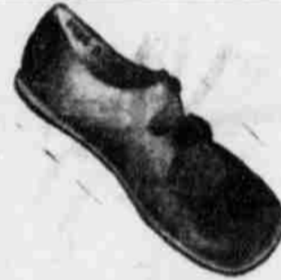
"A Child Might Go Bare-foot in a Kyn-B Shoe and Never Miss the Stockings."

You want shoes for the child that are comfortable, also shoes that will give the child good service. We are able to fill your wants to the minutest detail. Golden Rule Shoes are better. A trial will convince you.