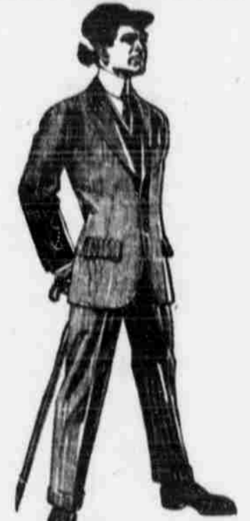
Copyright "A" The House of Kuppenheimer Chicago Dauntless Trousers, union made, $3.50 to $5.00

This is not an exaggeration, but a plain fact backed up by hand-tailored, steam-shrunk, all-wool garments. We only ask you to compare them with other suits at the same prices. We are now displaying the new spring shades. Golden Rule Suits go at $9.50, $10.00, $11.50, $12.50, $15.00, and $16.50. Kuppenheimer Suits at $20.00, $22.50, $25.00 and $30.00.