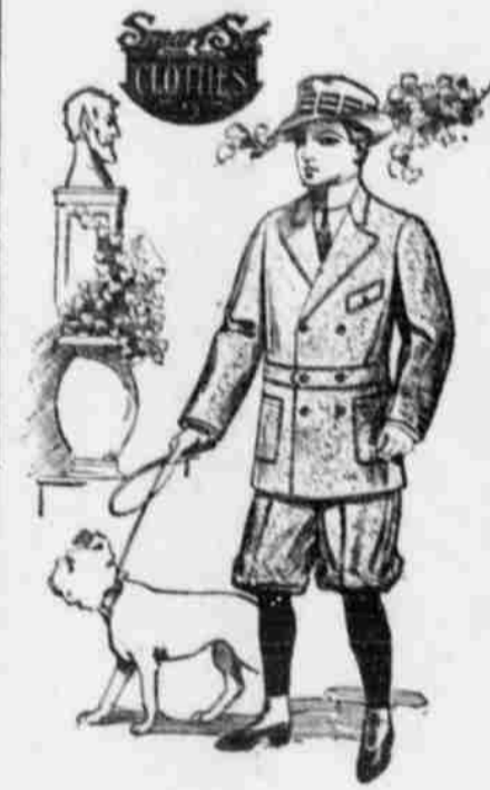
These Suits will please the boy because they are stylish. The value will please the parent.

We can supply the whole family, from the little fellow to the old gentleman. Our suits are made exclusively for the Golden Rule; made to fit; made of the very best materials it is possible to put into suits at the prices we ask.