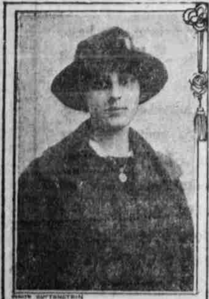
CRYSTAL EASTMAN BENEDICT

Suffrage organizations in New York city started the campaign to win "Votes for Women" in the State of Wisconsin by holding a mass meeting at the Hotel Astor. Mrs. Oliver H. P. Belmont as president of the Political Equality Association is one of the leaders in the campaign fight. One of the speakers was Mrs. Crystal Eastman Benedict, a leader in the Wisconsin campaign.