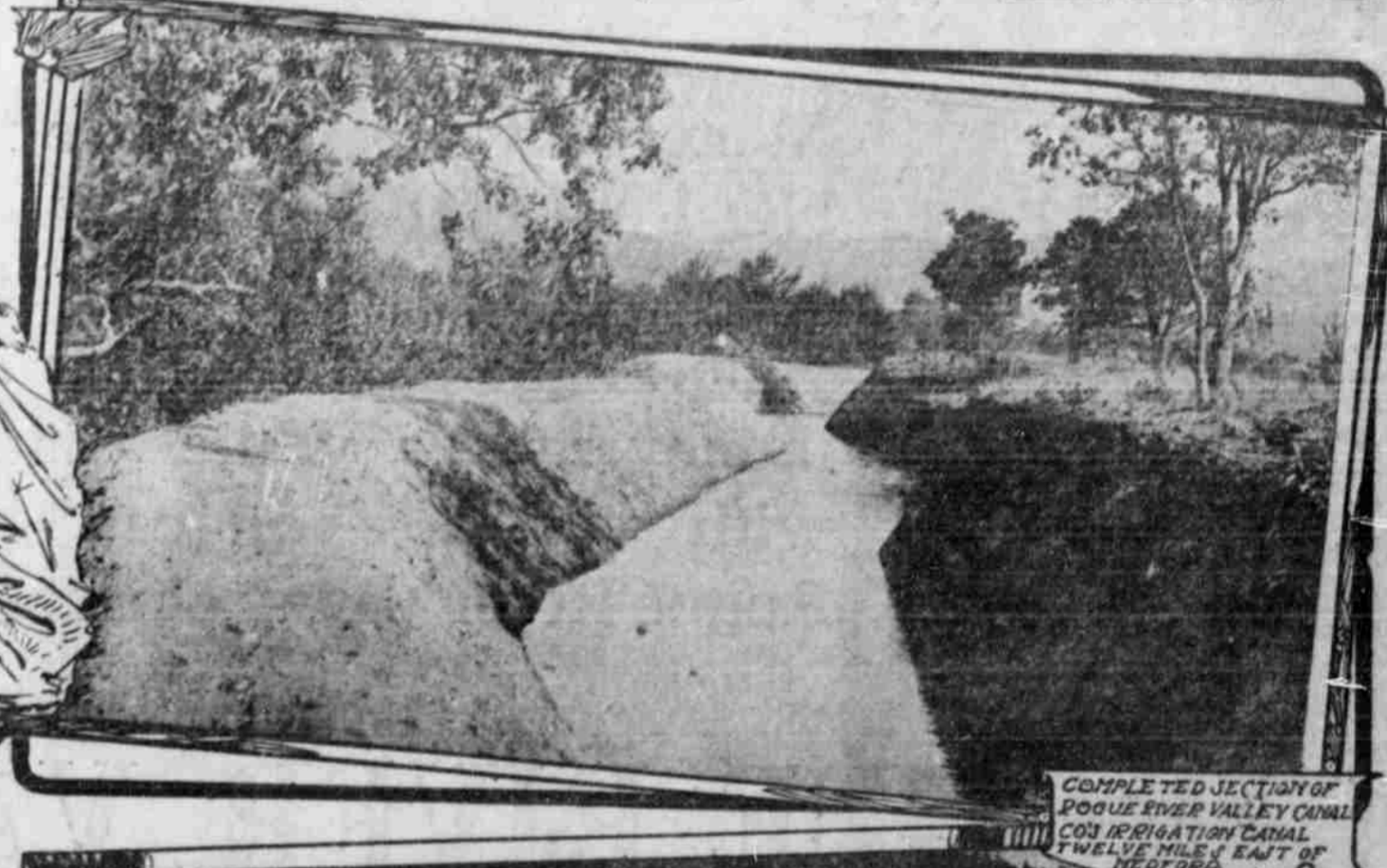
COMPLETED SECTION OF ROGUE RIVER VALLEY CANAL CO'S IRRIGATION CANAL TWELVE MILES EAST OF MEDFORD