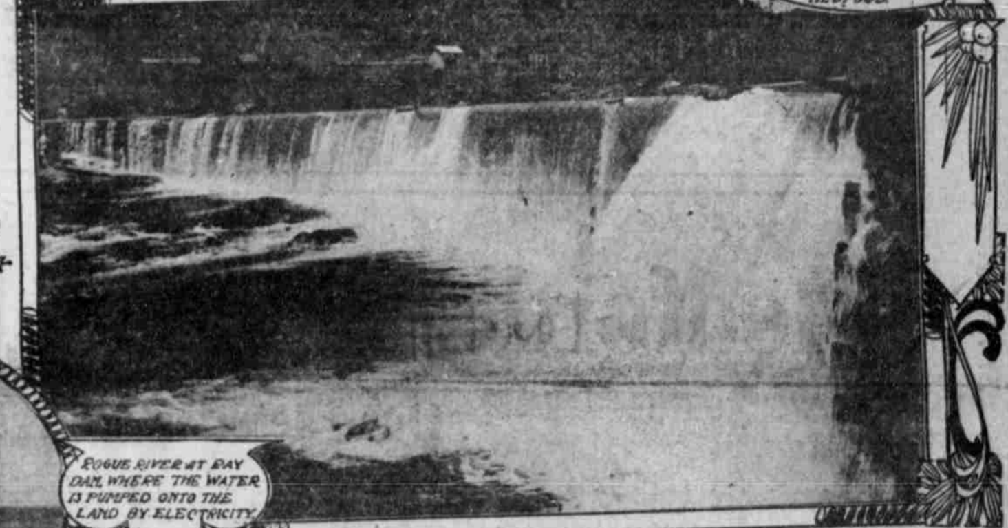
ROGUE RIVER AT RAY DAM, WHERE THE WATER IS PUMPED ONTO THE LAND BY ELECTRICITY