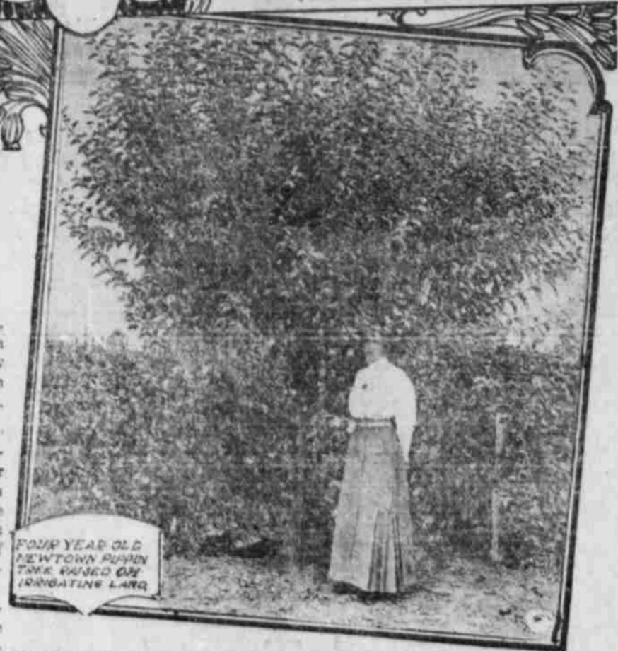
FOUR YEAR OLD PLANT TREES WHICH YIELDING THIS YEAR IN 1911

Irrigation is destined to play a most important part in the development of Rogue river valley, supplying as it does the one deficiency that now prevents intensive production. Its benefit to the orchard industry has in the past been more or less of a debatable question. Much good fruit has been and is now being raised without irrigation and young orchards are being grown without its aid, but such production and growth on unirrigated land is at the mercy of the summer rains which may or may not occur in proper season and the bearing orchard or young orchard just set out, unless most favorably located, is forced to suffer during average seasons because of insufficient moisture in the soil.