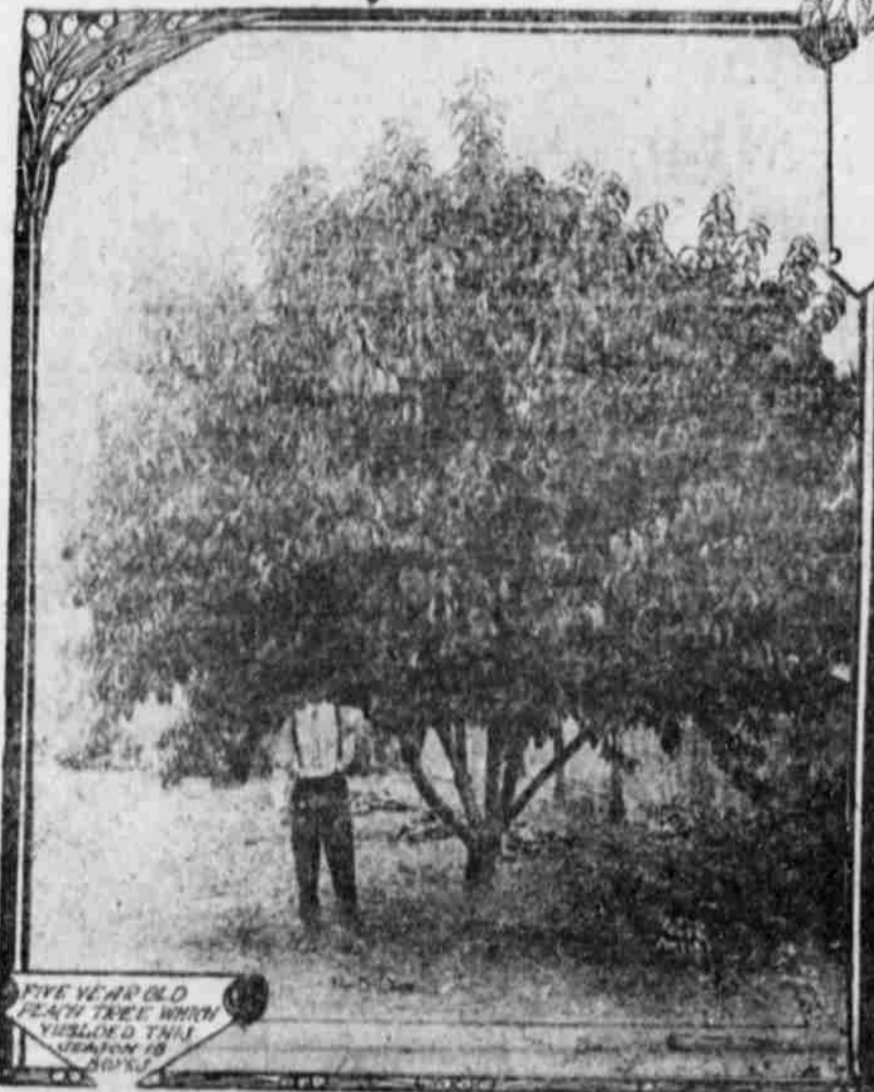
FIVE YEAR OLD PLANT TREES WHICH YIELDING THIS YEAR IN 1911

Some of the Big Enterprises that will Water Thousands of Acres of Orchards