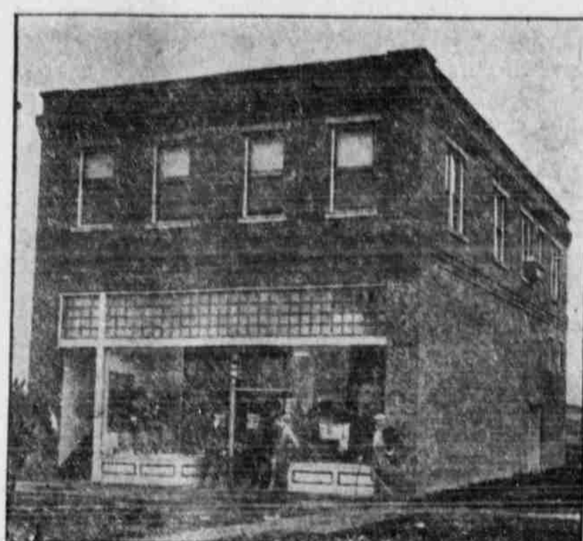
Von der Hellen Bros., Hardware.

It takes people to make a city, and with the idea of making it an inducement to settle in the vicinity and help in the work of building up Eagle Point THE MOUNTAIN VIEW LAND COMPANY have platted and are now offering for sale on ground floor basis a number of five and ten acre tracts in this subdivision, on the high ground adjacent to Eagle Point, at prices ranging from FIFTY DOLLARS per acre and up. Of course, this offer will have its limits, but for the next few months our policy will be, "First Come, First Served." We don't ask anyone to gamble on the future, but where in the west does such an opportunity exist, adjacent to a live burg like Eagle Point? These tracts will soon be under pipe line, and for general attractiveness are not surpassed anywhere. Get in touch with us at once, and