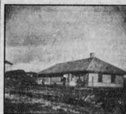
Eagle Point Depot, Pacific & Eastern Railway (Hill System).