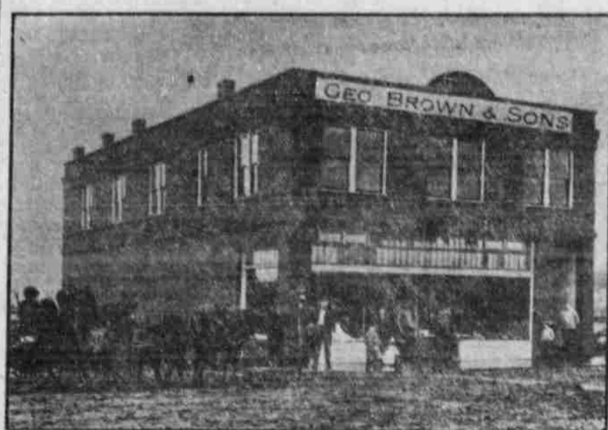
A Pioneer Firm in New Quarters.

The prosperity of this section is shown conclusively in the growth of the Eagle Point bank, in business but little more than one year. Watch its next statement. Its resources have almost doubled since its last pub-