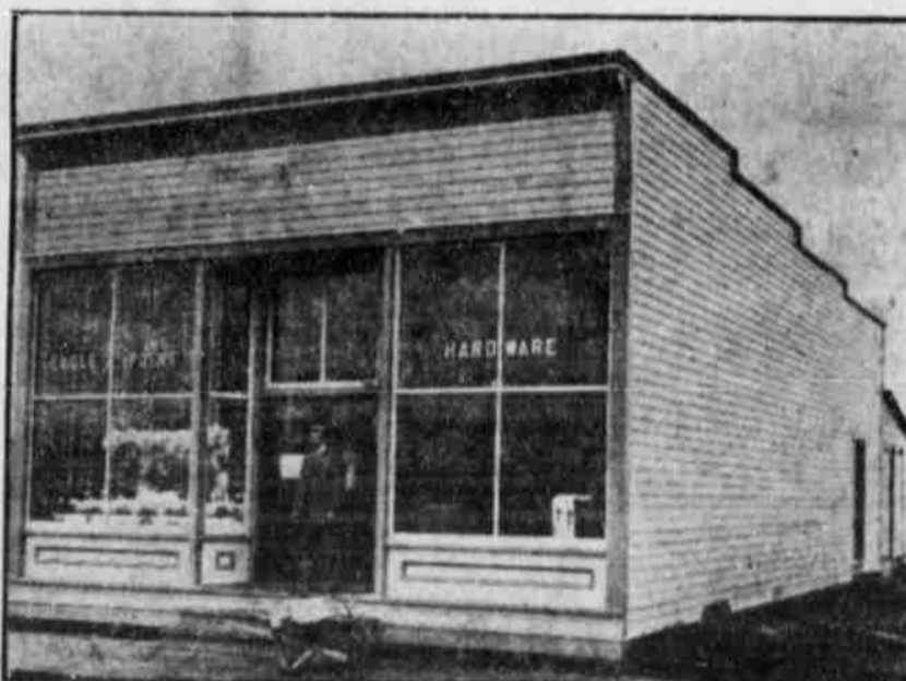
Eagle Point Hardware Co., Near Depot.