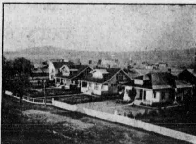
A Group of Residences, Eagle Point.