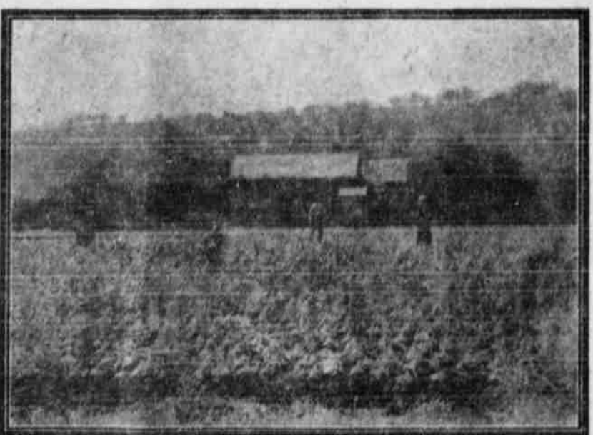
A Field of Onions—For Which Eagle Point Is Famous.