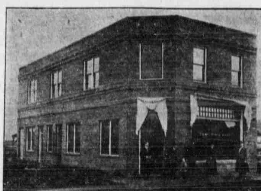
First State Bank of Eagle Point Building.