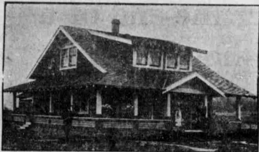
Judge Stewart's Bungalow in New Town.