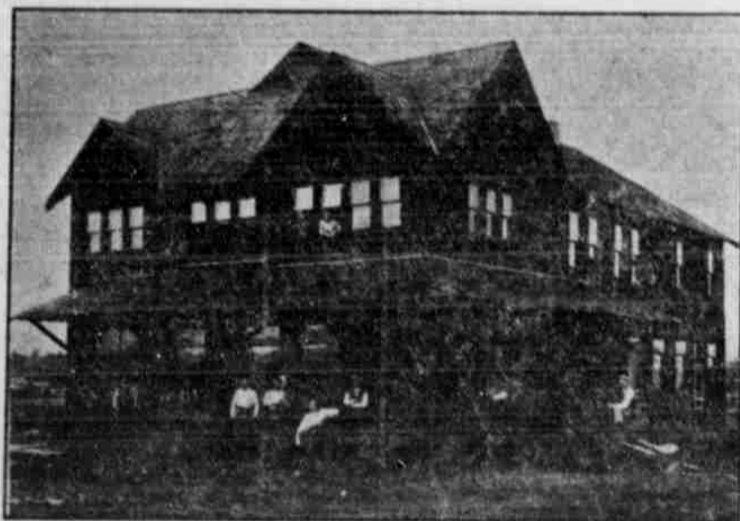
A December Day at the Eagle Point Tavern.