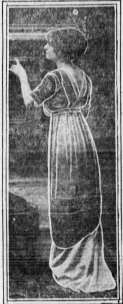
Peach color liberty satin gown with blue tulle—Maison Bernard.