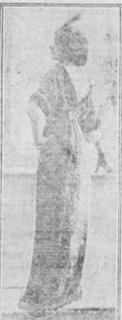
Bronze velle gown embroidered in gold and trimmed with sable.