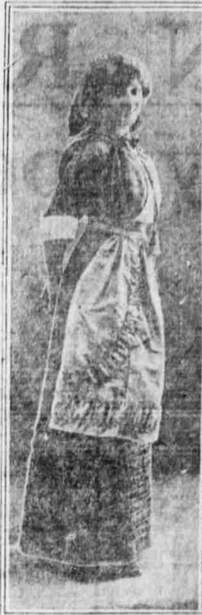
Red Liberty Bellie gown, black taffeta sleeves.