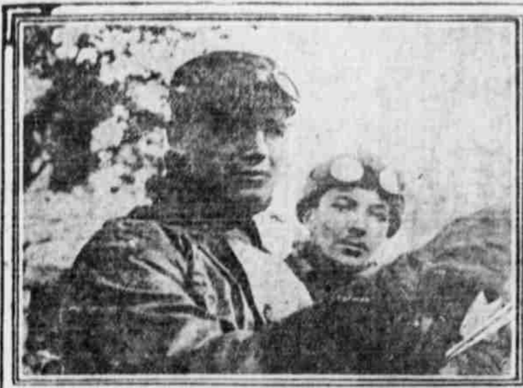
RALPH DE PALMA WHO WILL DRIVE A MERCEDES CAR IN THE SAVANNAH CHALLENGE TROPHY RACE