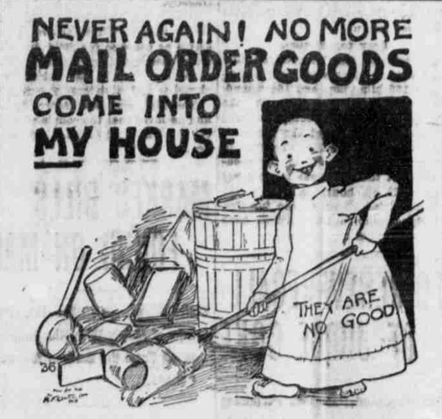
FIGURE ON THE FREIGHT BEFORE YOU SEND OFF TO THE MAIL-ORDER HOUSE FOR HARDWARE. IT IS HEAVY AND THE FREIGHT WILL COST LIKE ALL-FIRE.

Ask your dealer to show you his line of Rayo lamps; or write for descriptive circular to any agency of the Standard Oil Company Incorporated)