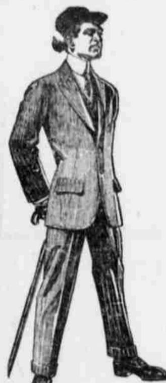
Copyright 1911 The House of Kuppenheimer Chicago

25 Men's and Boys' Suits at 25 per cent discount this week