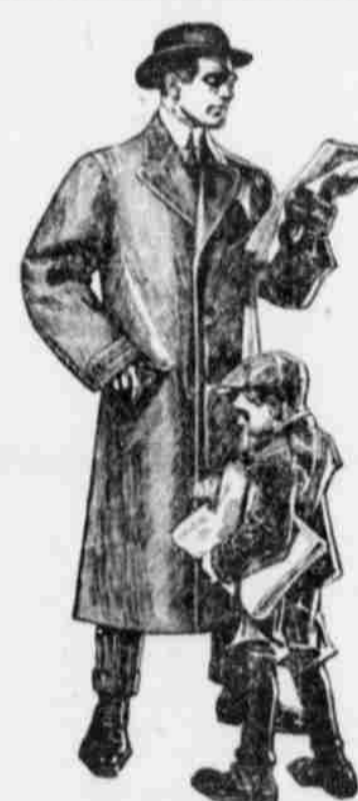
Copyright 1911 The House of Kuppenheimer Chicago