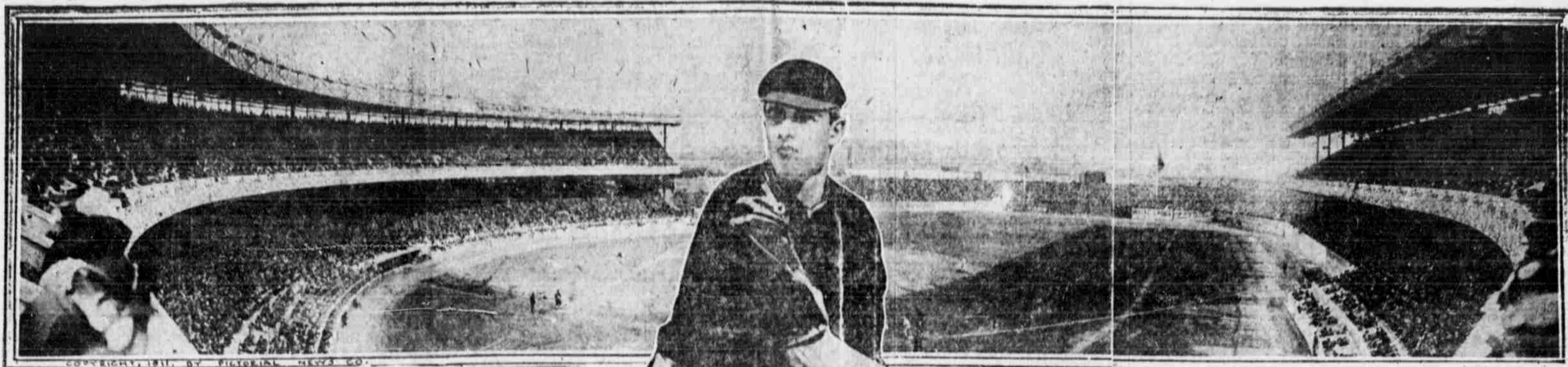
PANORAMIC VIEW OF POLO GROUNDS DURING GAME.