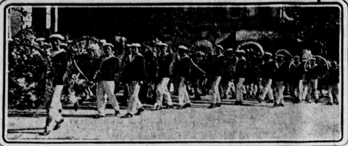
FUNERAL OF VICTIMS OF THE LIBERTE DISASTER. The above photograph depicts a scene in Toulon when the victims of the disaster to the French cruiser Liberte were borne to their last resting place.