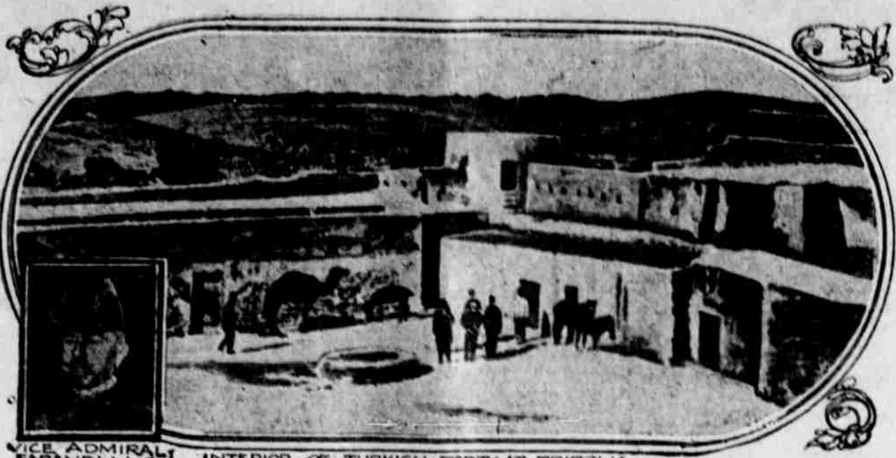
INTERIOR OF TURKISH FORT AT TRIPOLI

port business not as good as usual. A gentleman from Spokane, Wash., told one of our leading bankers the other day that the week after the recent fair held at Spokane that the bankers of that city found that their deposits had increased over one million dollars by the money left in the city from visitors to the fair. It is a well known fact that the merchants of St. Paul and Minneapolis have stated that the visitors from the country left over $3,000,000 in the Twin cities fair week.