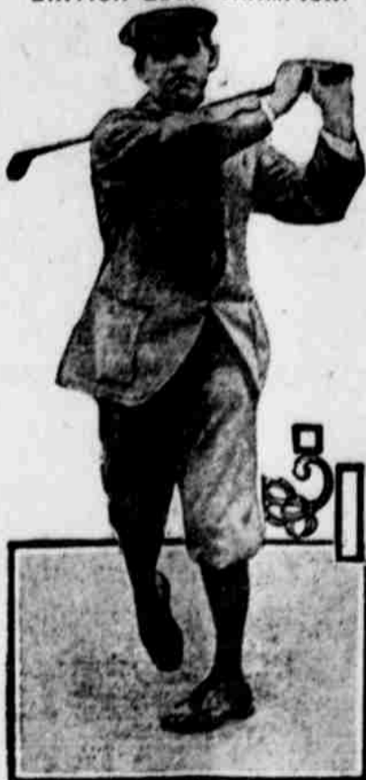
HAROLD H. HILTON.

Mr. Howard H. Hilton, British amateur champion golfer, is now in this country and is hot after our national golfing title, which will be played for at Apawamis Club Links, Rye, N. Y.