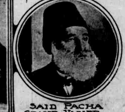
SAID PACHA GRAND VIZIER.