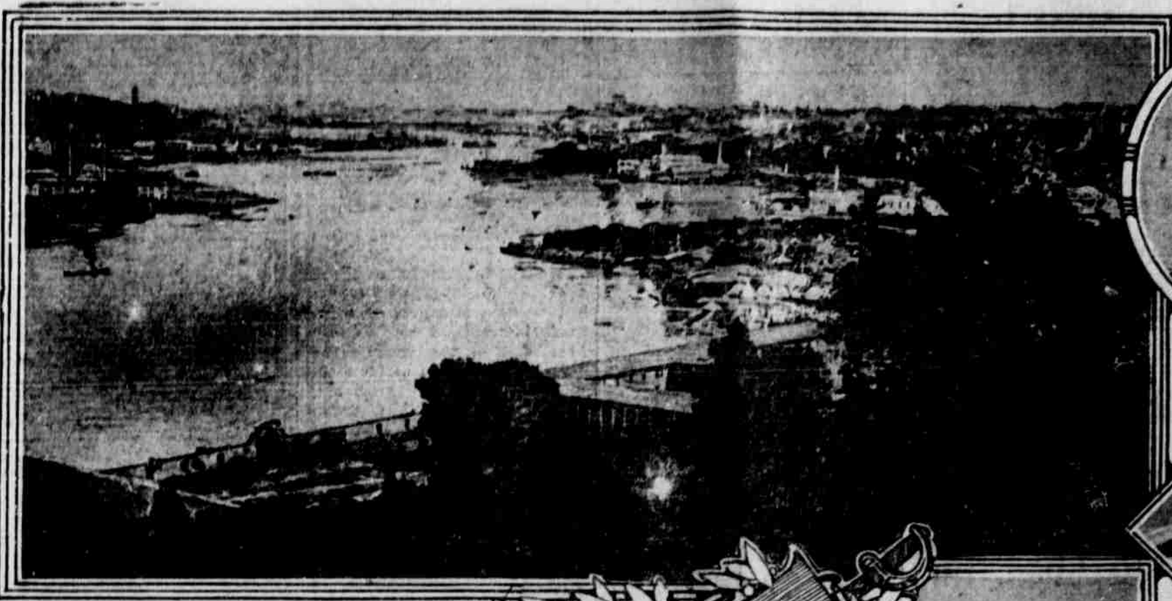
HARBOR OF PREVEZA TURKEY.