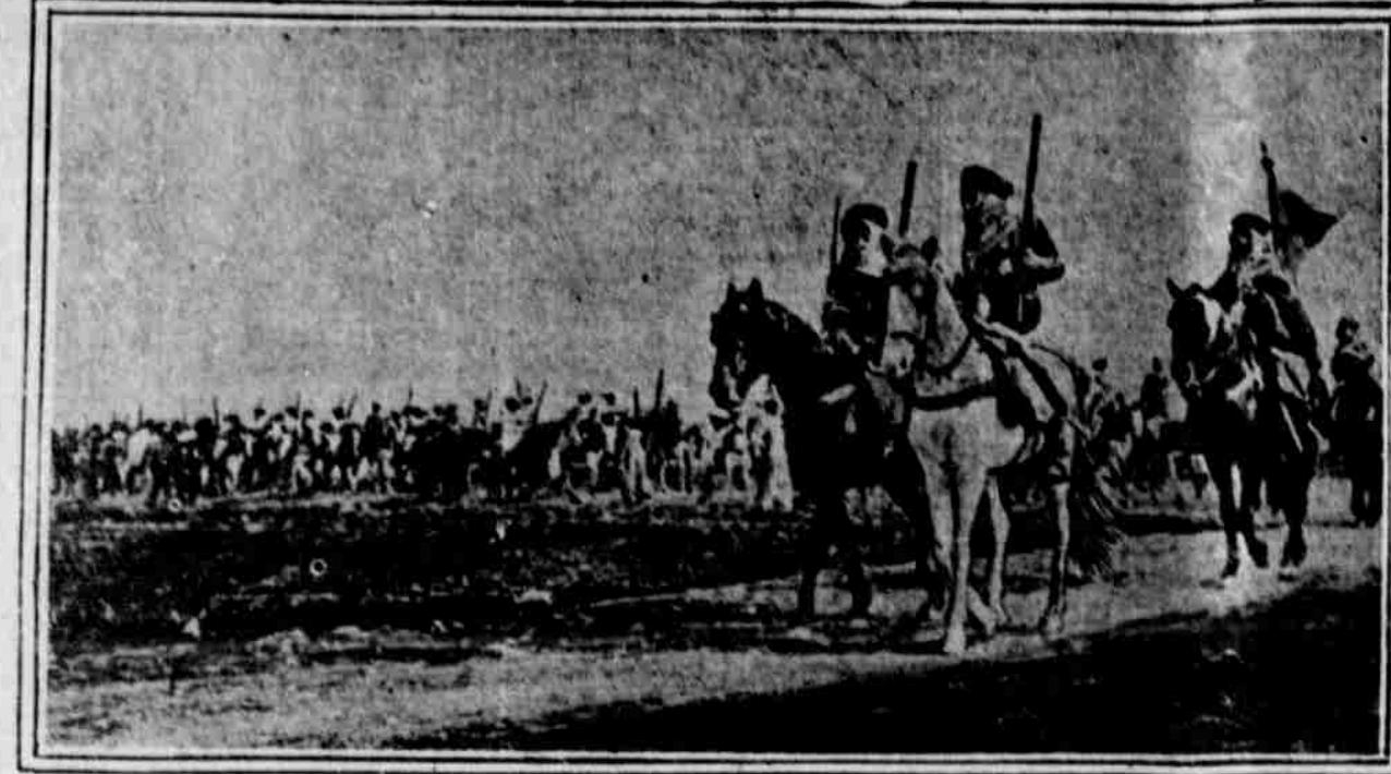
HORSEMEN OF TRIPOLT