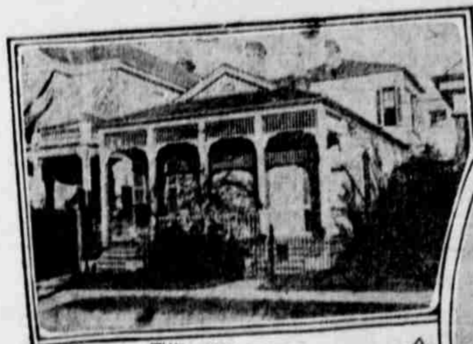
THE CRAWFORD HOME.