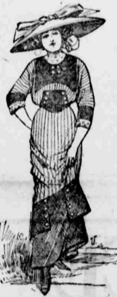
SMART YOKED GOWN.

A combination of striped and plain materials, which is suitable for either a foulard, percale or lawn dress, is illustrated here. The round neck may