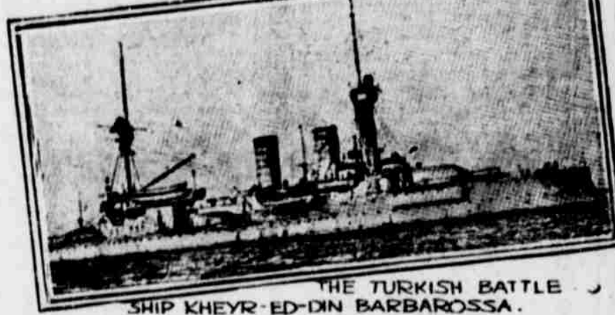
THE TURKISH BATTLE SHIP KHEYR-ED-DIN BARBAROSSA.