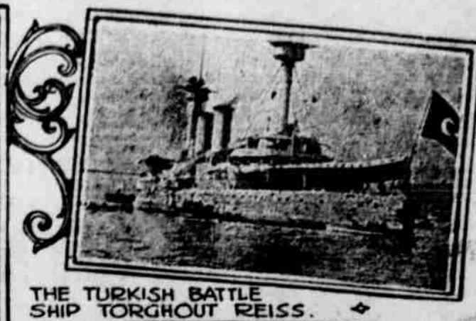
THE TURKISH BATTLE SHIP TORGHOUT REISS.