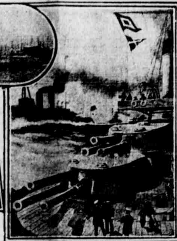
THE TRIPLE-GUN TURRETS OF THE ITALIAN BATTLE SHIP DANTE ALIGHIERI.