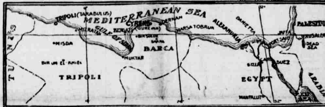
SCENE OF THE DISPUTE BETWEEN ITALY AND TURKEY.