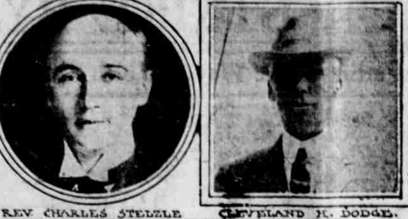
LEADERS IN MOVEMENT TO EVANGELIZE & CONTINENT

Financed by business men of national prominence whose combined wealth runs into the hundreds of millions and who will conduct it as they would a private business affair, the United States and Canada are on the eve of a common sense religious crusade such as is not recorded in the previous history of the human race since the reformation, and which, its pro-inoters proclaim, will be further reaching in its effect than the crusades of history.