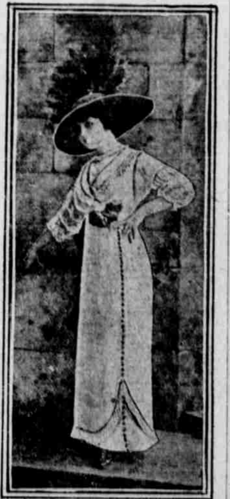
Fine mauve color silk gown. Photo Courtesy, 1911, by Haskins.