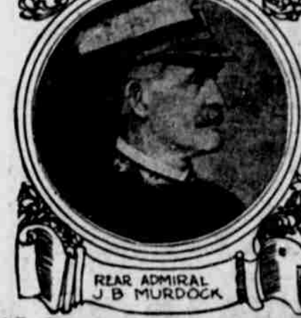
REAR ADMIRAL J. B. MURDOCK