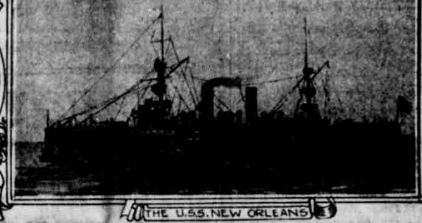
THE U.S.S. NEW ORLEANS