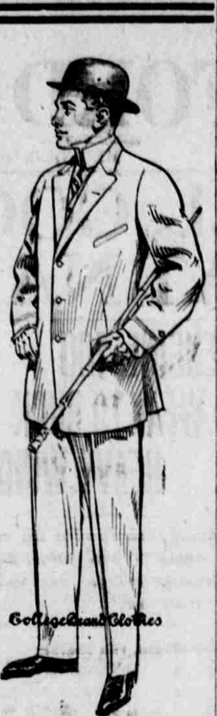
College Brand Clothes