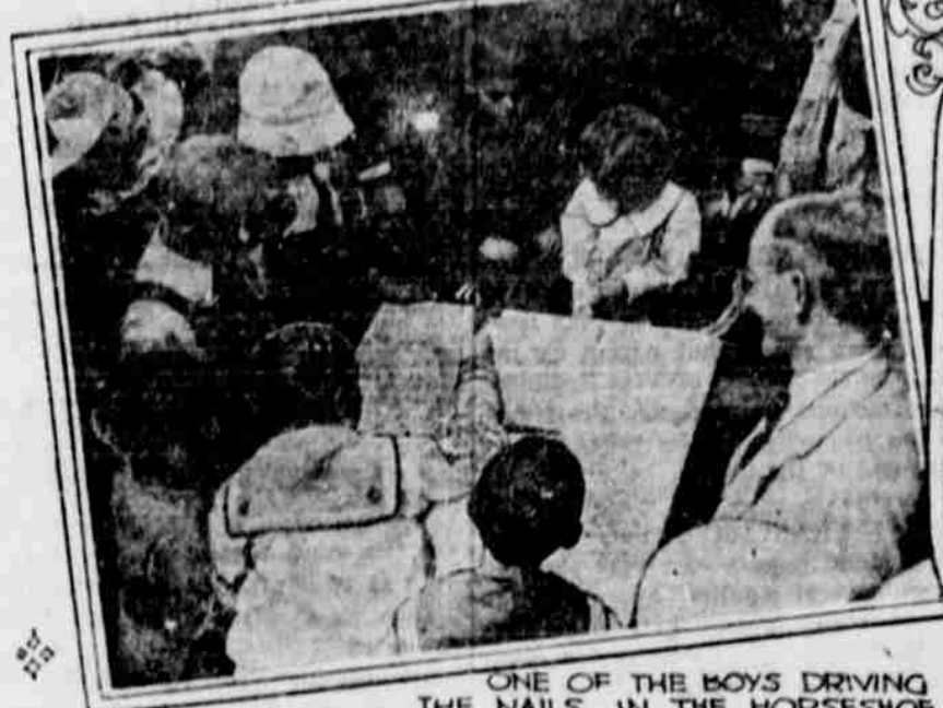
ONE OF THE BOYS DRIVING THE NAILS IN THE HORSESHOE.