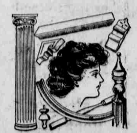
FIGURE WITH YOU ON MILL WORK. COMPLETE EQUIPMENT ENABLES US RIGHT AND WORK RIGHT.

YOU MAY CHOOSE A HANDSOMER ONE WHEN YOU SEE OUR MANY STYLES AND LEARN HOW MODER ATELY OUR MIIL WORK IS PRICED