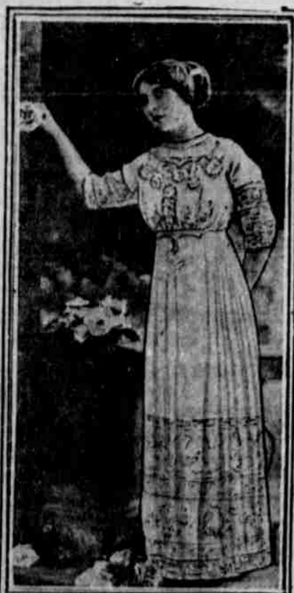
White linen gown.