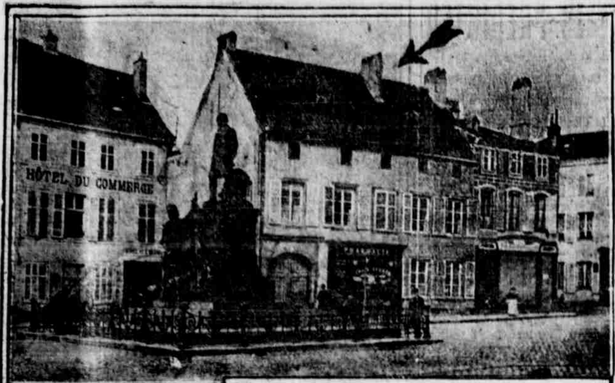
BUILDING (IN CENTRE) WHERE THE NAME "AMERICA" FIRST WAS PRINTED.

St. Die, in southern France, is in festive garb this week, and crowds are flocking to the city from all directions to take part in the exercises commemorating the naming of America, in 1507. Mr. Robert Bacon, United States ambassador to France, is taking part in the exercises. The program includes the placing of a commemorative tablet on the house where the name America was first given to the New World in a little pamphlet on the discoveries of Amerigo Vesputci the explorer. On the tablet is an inscription, a translation of which is as follows: