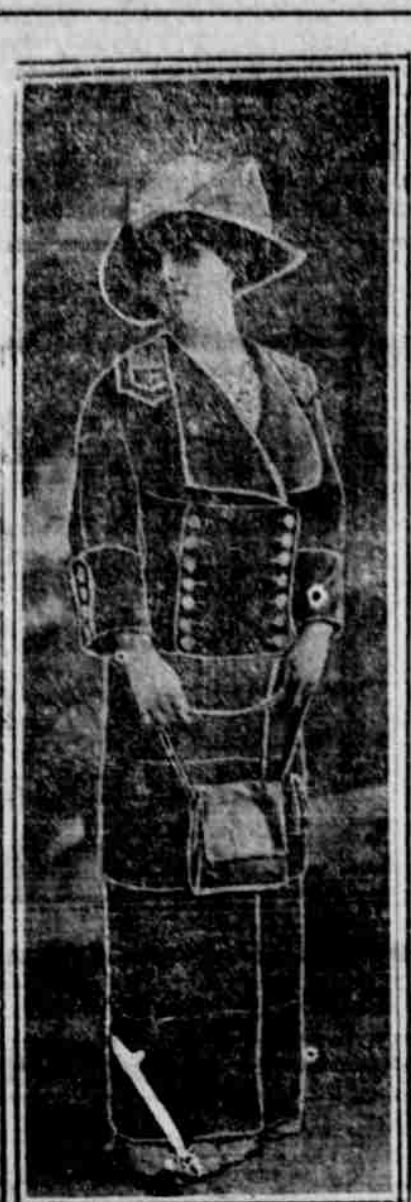
Blue silk coat with blue and white striped collar—Maison Drecoll.