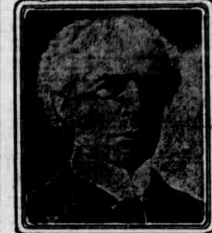
SIR WILFRID LAURIER