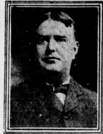
"DAN" JOHNSON The famous baseball magnate wh-