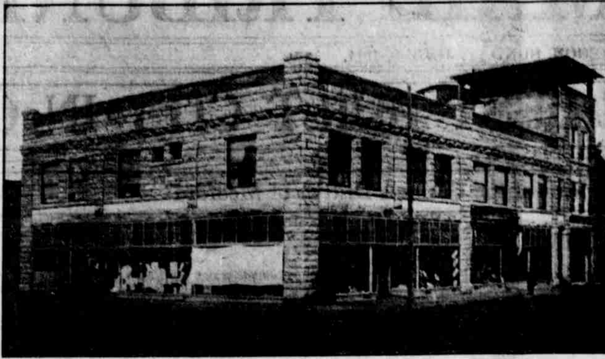
St. Marks block, completed within the past year by the St. Marks Episcopal church.