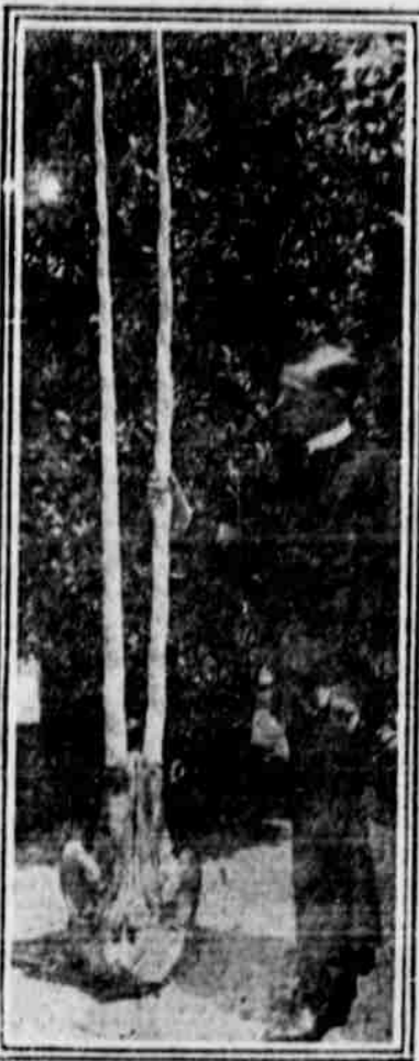
MAMMAL TUSKS IN BRONX ZOOLOGICAL PARK.