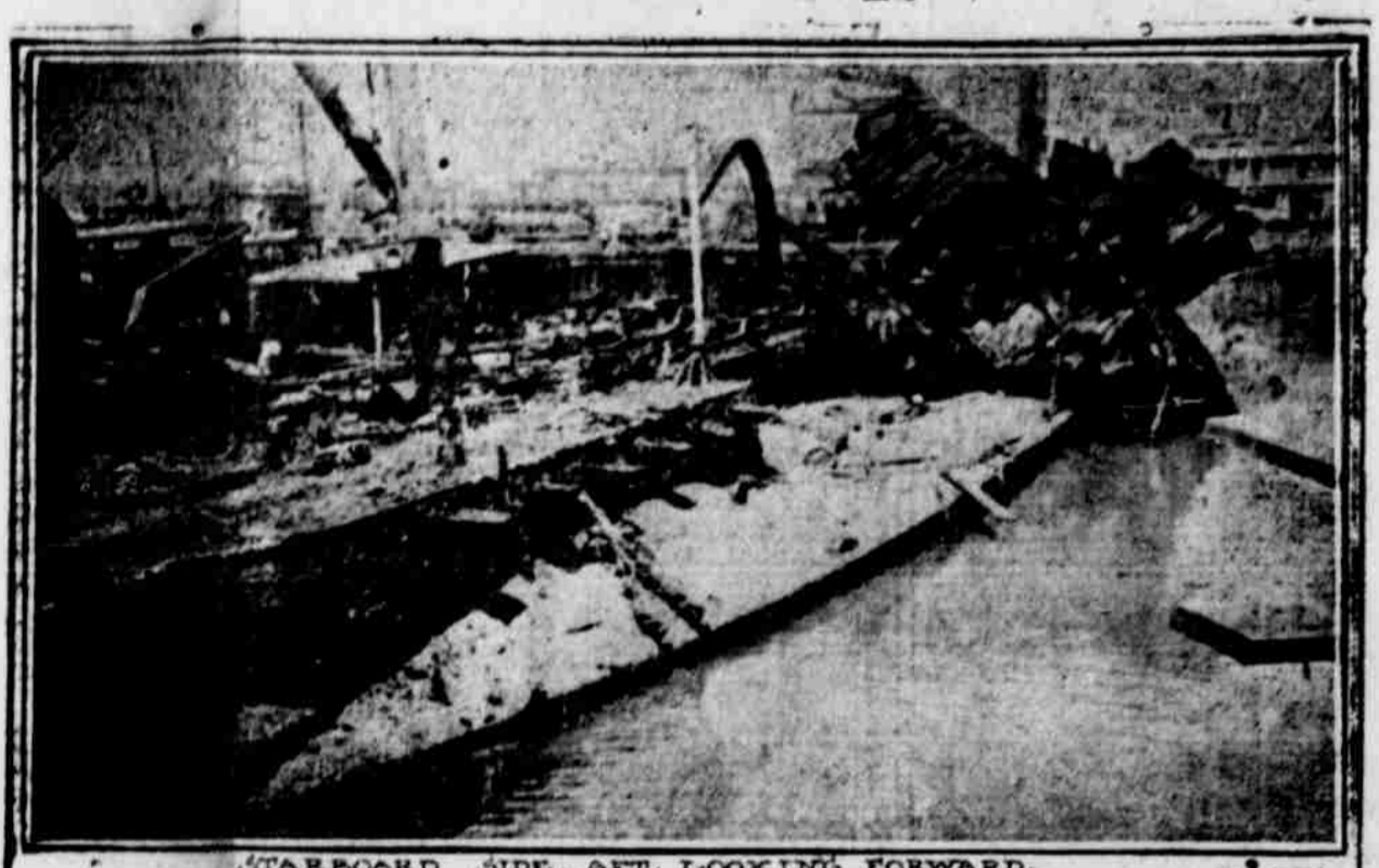
The photograph above gives a fair idea of how the old battleship Maine looks today. The view is of the starboard side, aft, looking forward.