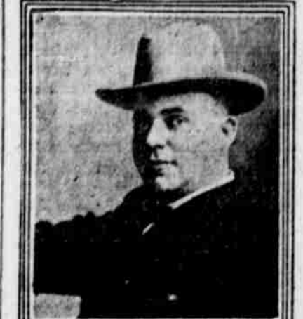
AUGUSTUS O. STANLEY

WASHINGTON, D. C., June 20.—"It's a boy," said the happy voice of Representative Augustus O. Stanley as he telephoned members of the steel investigating committee that today's session was off. The Stanley heir arrived this morning. "I don't give a whoop for all the trusts in the world now," said Stanley.