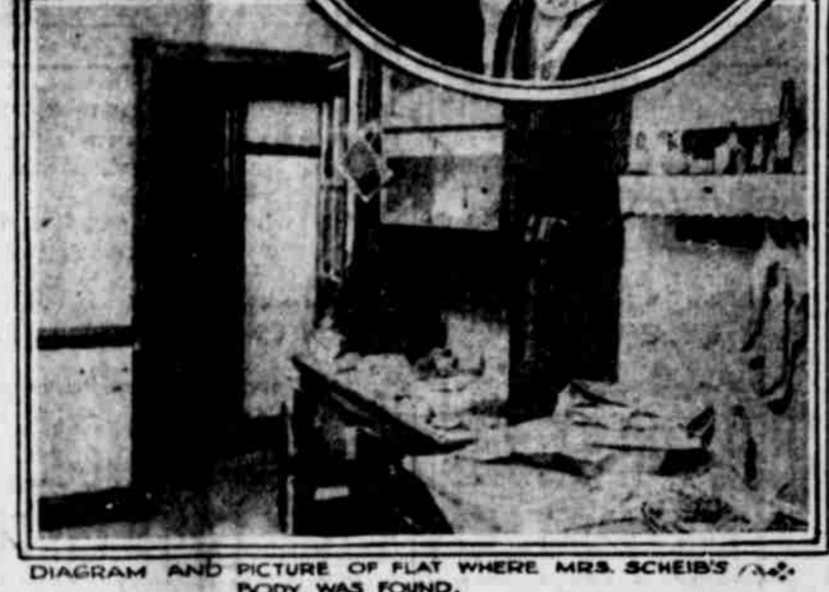
DIAGRAM AND PICTURE OF FLAT WHERE MRS. SCHEIB'S BODY WAS FOUND.