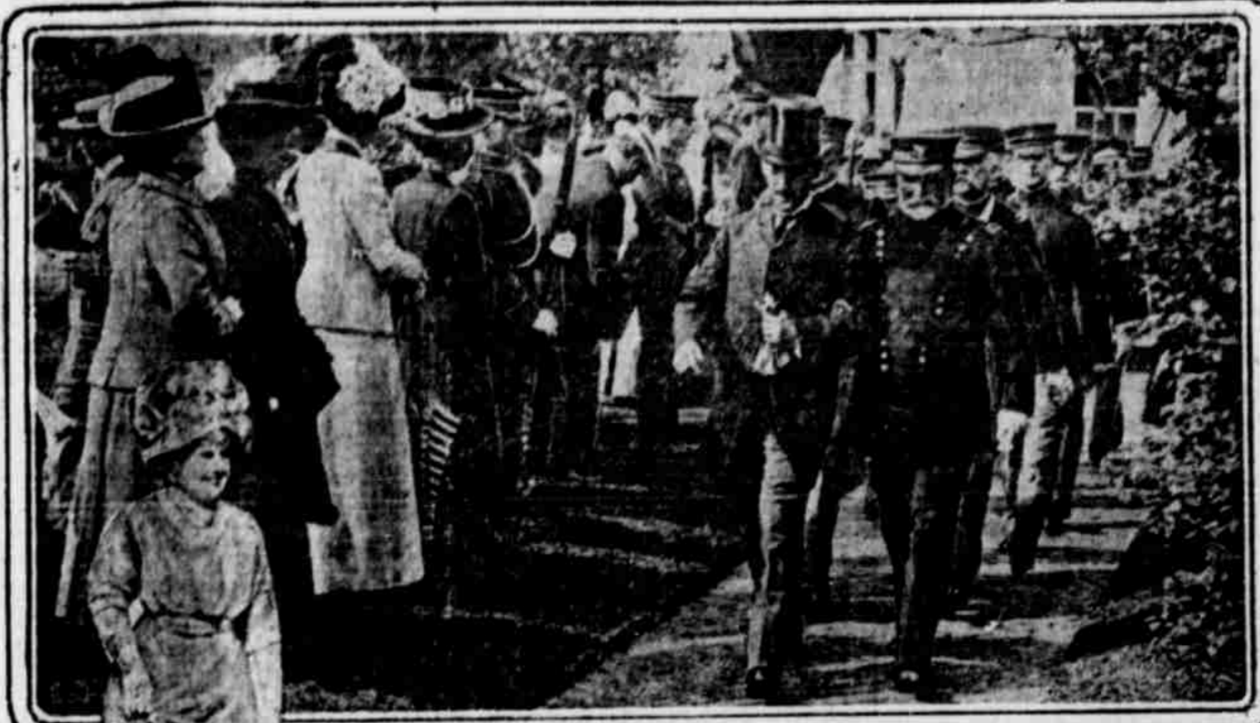
MAJOR GENERAL GRANT ESCORTING SECRETARY OF WAR STIMSON TO RECEPTION